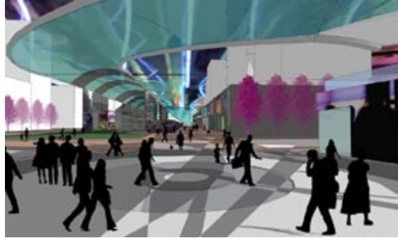
iCITY: Public Space v2.0

Student Awards: Individual thesis iCITY: Public Space v2.0 (Calgary, AB) Allison Wood, University of Calgary