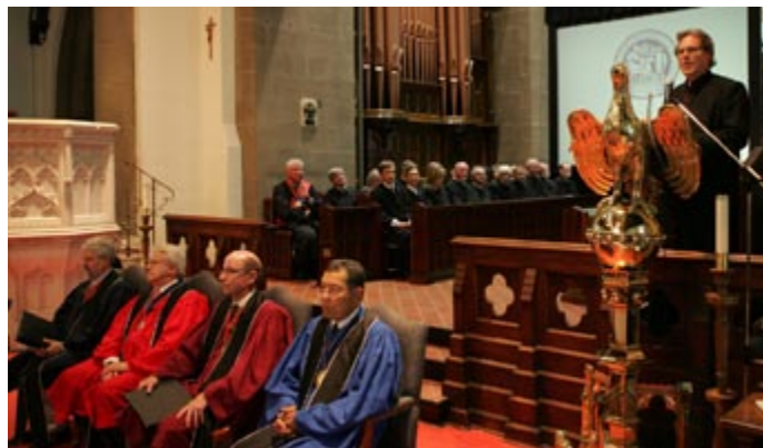
2008 Fellows convocation ceremony

The Chancellor and the National Committee of the College of Fellows administer the affairs of the College of Fellows and act as the Trustees of the RAIC Foundation.