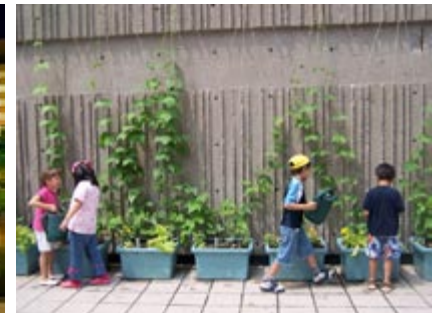
Making the Edible Campus