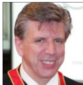
The Honourable Herménégilde Chiasson, Hon. FRAIC