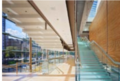
Four Seasons Centre for the Performing Arts

River Landing Riverfront Master Plan (Saskatoon, SK) Lead Firm: Crosby Hanna & Associates, Landscapes Architecture & Planning