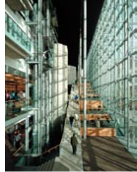
Winnipeg Centennial Library Addition