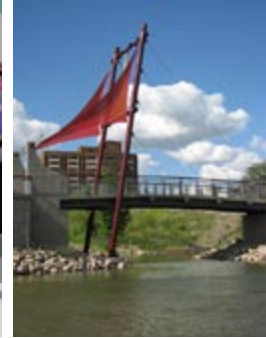
River Landing Riverfront Master Plan