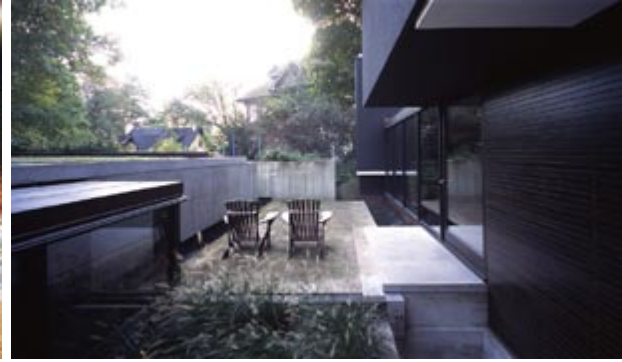
Gleneagles Community Centre House at 4a Wychwood Park