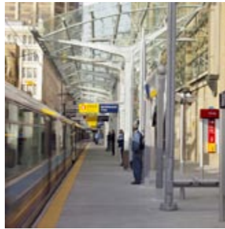
7 Avenue LRT Refurbishment

Pierre Dansereau Science Complex, Université du Québec à Montréal (Montreal, QC) Lead Firms: Saia Barbarese Topouzanov architectes, in consortium with Tétréault Languedoc architectes