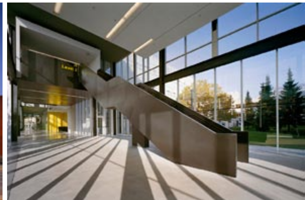
Communication, Culture and Technology Building – University of Toronto Mississauga