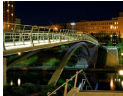
Corktown Footbridge