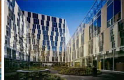
Pierre Dansereau Science Complex, Université du Québec à Montréal