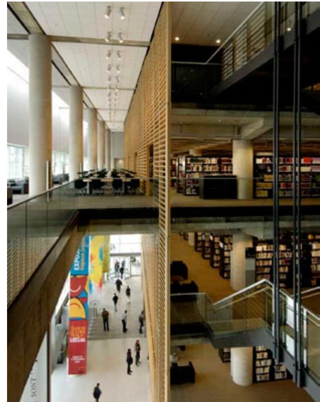
La Grande Bibliothèque du Québec (2000 competition) | Patkau / Croft Pelletier / Menkes Shooner Dagenais Associated Architects

All the information on the website was reviewed and it continually underwent maintenance and updates to ensure accuracy and relevance.