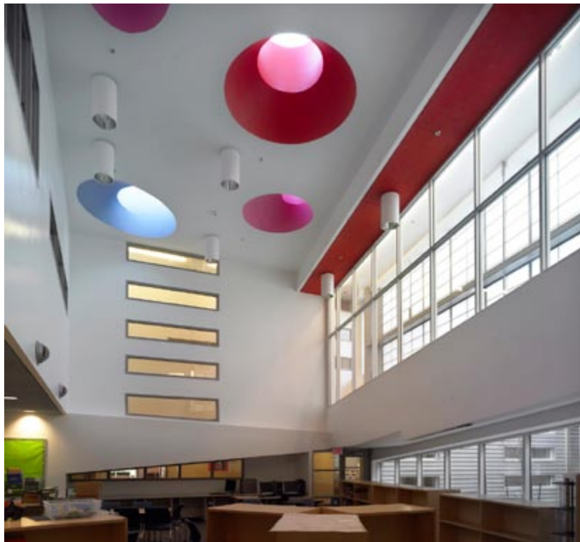
Brookside Public School (LEED® Gold-certified) | Teeple Architects Inc.