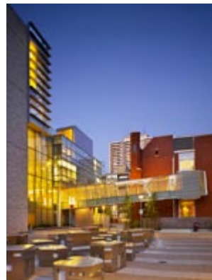
Canada's National Ballet School Project Grand Jeté