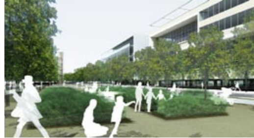
Le Campus Outremont

Le Campus Outremont (Montreal, QC) Lead Firms: Groupe Cardinal Hardy in collaboration with Provencher Roy + Associés architectes