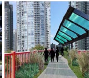
False Creek