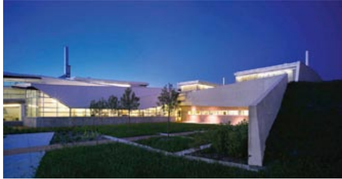
Trent University Chemical Sciences Building