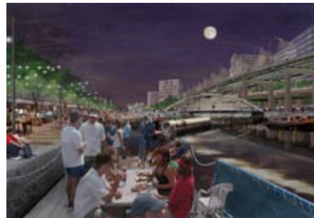
Lower Don Lands

Corktown Footbridge (Ottawa, ON) Lead Firm: Du Toit Allsopp Hillier / Du Toit Architects Limited