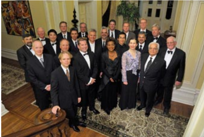
Her Excellency and the recipients of the 2008 Governor General's Medals in Architecture

The Governor General's Medals in Architecture recognize outstanding achievement for the "art" of architecture in recently built projects by Canadian architects. This program, created by the RAIC, contributes to the development of the discipline and practice of architecture, and increases public awareness of architecture as a vital cultural force in Canadian society. These awards are administered jointly with the Canada Council for the Arts, which is responsible for the adjudication process and contributes to the publication highlighting the medal winning projects.