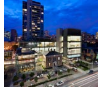
Canada's National Ballet School / Project Grand Jeté: Stage 1 Jarvis Street Campus and Radio City