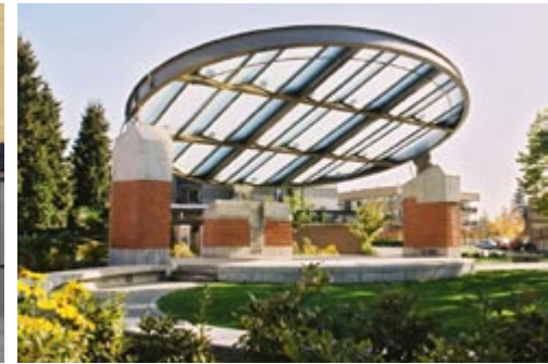
Leigh Square | photo: Boldwing Continuum Architects Inc.