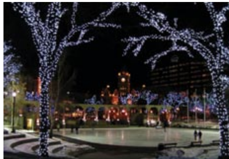
Calgary Starts Here: Olympic Plaza Cultural District Strategy

Leigh Square (Port Coquitlam, BC) Lead Firm: Boldwing Continuum Architects Inc.